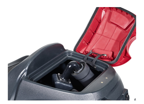
Large opening to the 73 liter recovery tank allows for easy cleaning