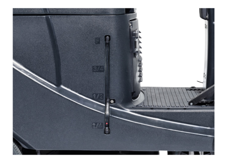
Water solution indicator with volume visible on the