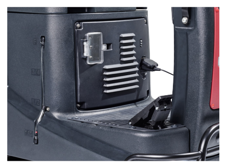
USB-port for fast charging of tablets and cell phones