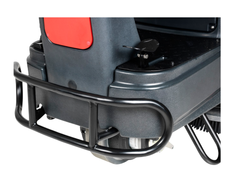
Front bumper protects the machine