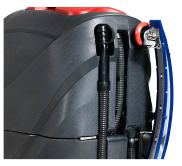
Built in squeegee hanging system for easy transport in narrow areas