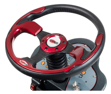
Intuitive dashboard, one touch button and user friendly menu for operation settings